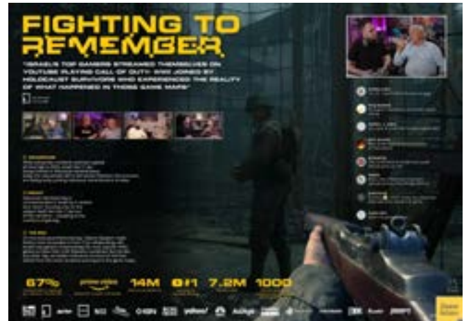
MCCANN, TEL AVIV